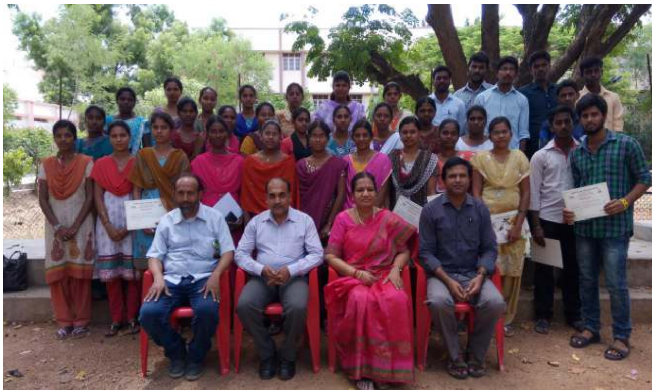
Technology based Entrepreneurship Development Programme (TEDP) candidates supported by TANSTIA-FNF Service Centre, Chennai