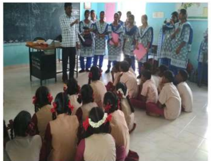
Counselling Process and Awareness Programmes organized by Family Counselling Centre