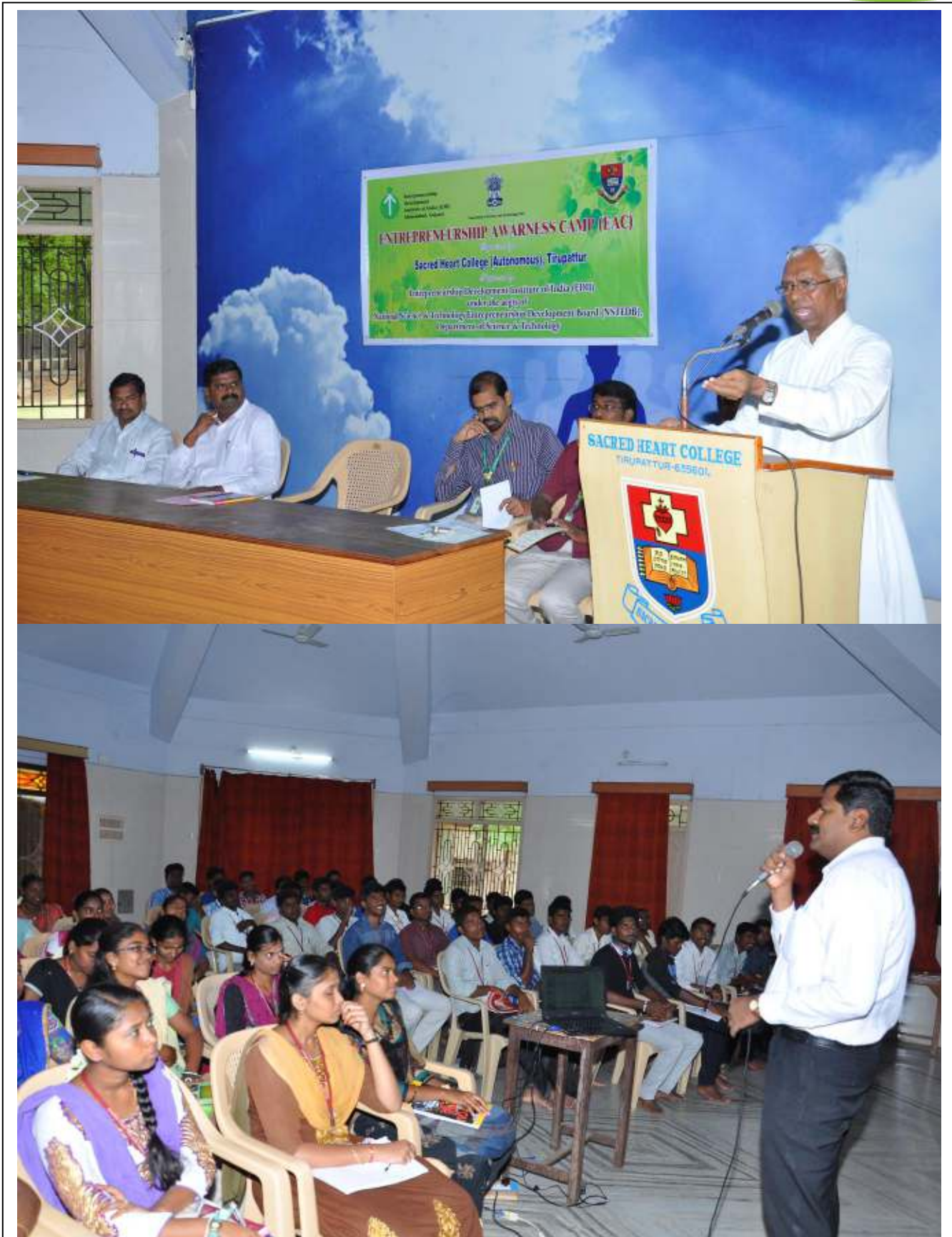
Entrepreneurship Awareness Camp supported by EDII, Ahmedabad and DST, Govt. of India