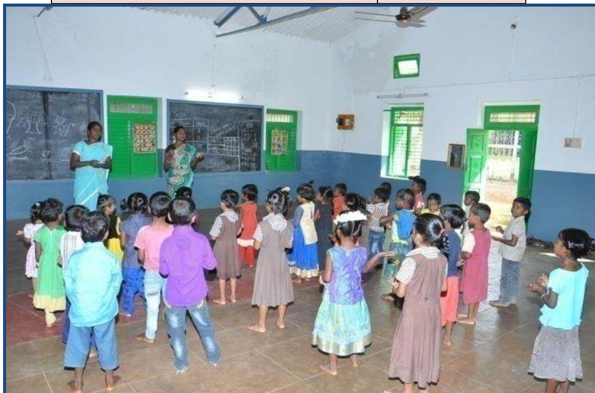
Children Activities at Creche Centre at Sivarajpet